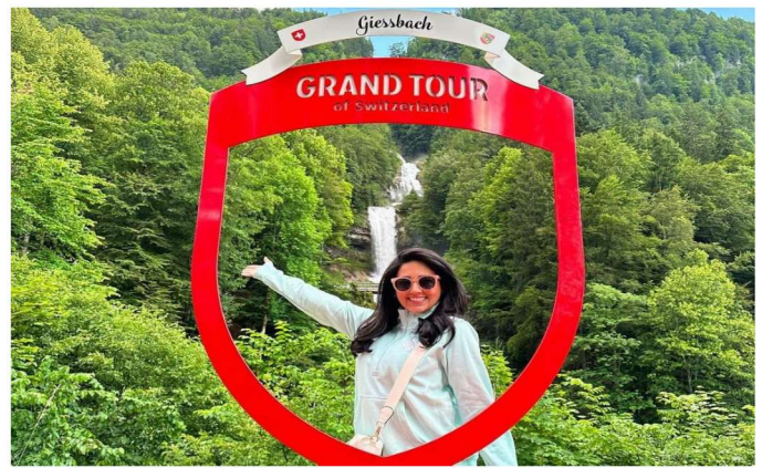
Examples of sculpture frames located at major tourist sites around the world.