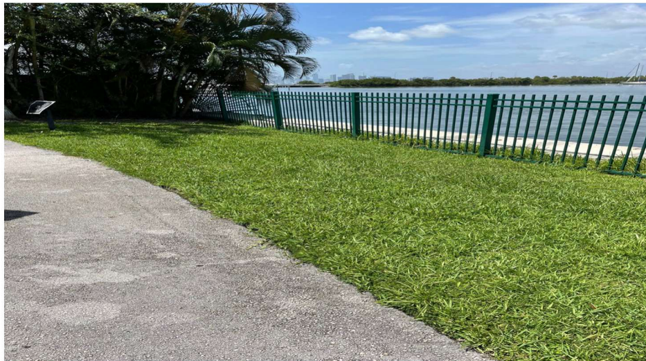
The grassy area where the sculpture frame will be placed.