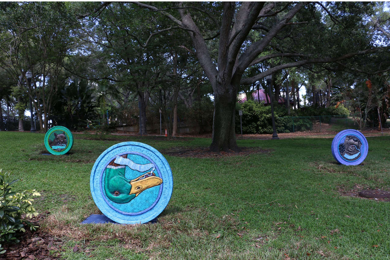
Jeff Whipple, "Relaxation Rollers", hand-built and cast GFRC, concrete stain, gloss clearcoat UV filter protection, 42" diameter x 6" wide, 2021. Commissioned by the City of St. Petersburg, Florida for Roser Park. THEME: Relaxation in a Park. There are quotes about relaxation and bas-relief "talking" animals on both sides.