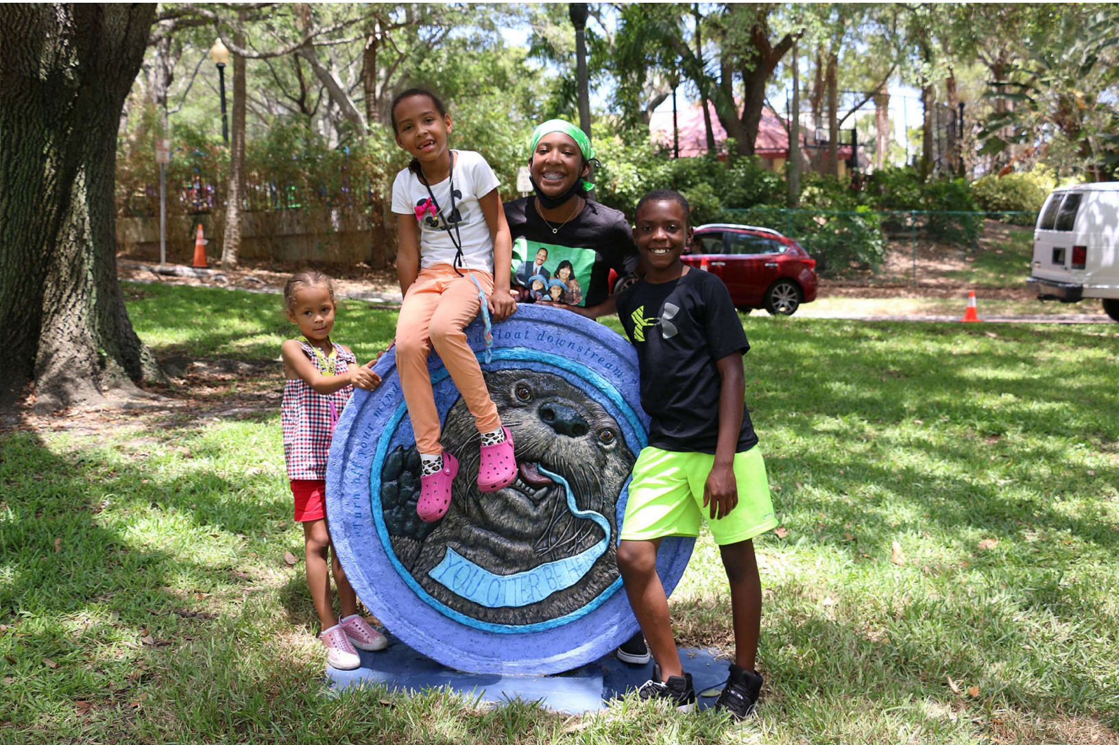
Jeff Whipple, "Relaxation Rollers", hand-built and cast GFRC, concrete stain, gloss clearcoat UV filter protection, 42" diameter x 6" wide, 2021. Commissioned by the City of St. Petersburg, Florida for Roser Park. THEME: Relaxation in a Park. There are quotes about relaxation and bas-relief "talking" animals on both sides.