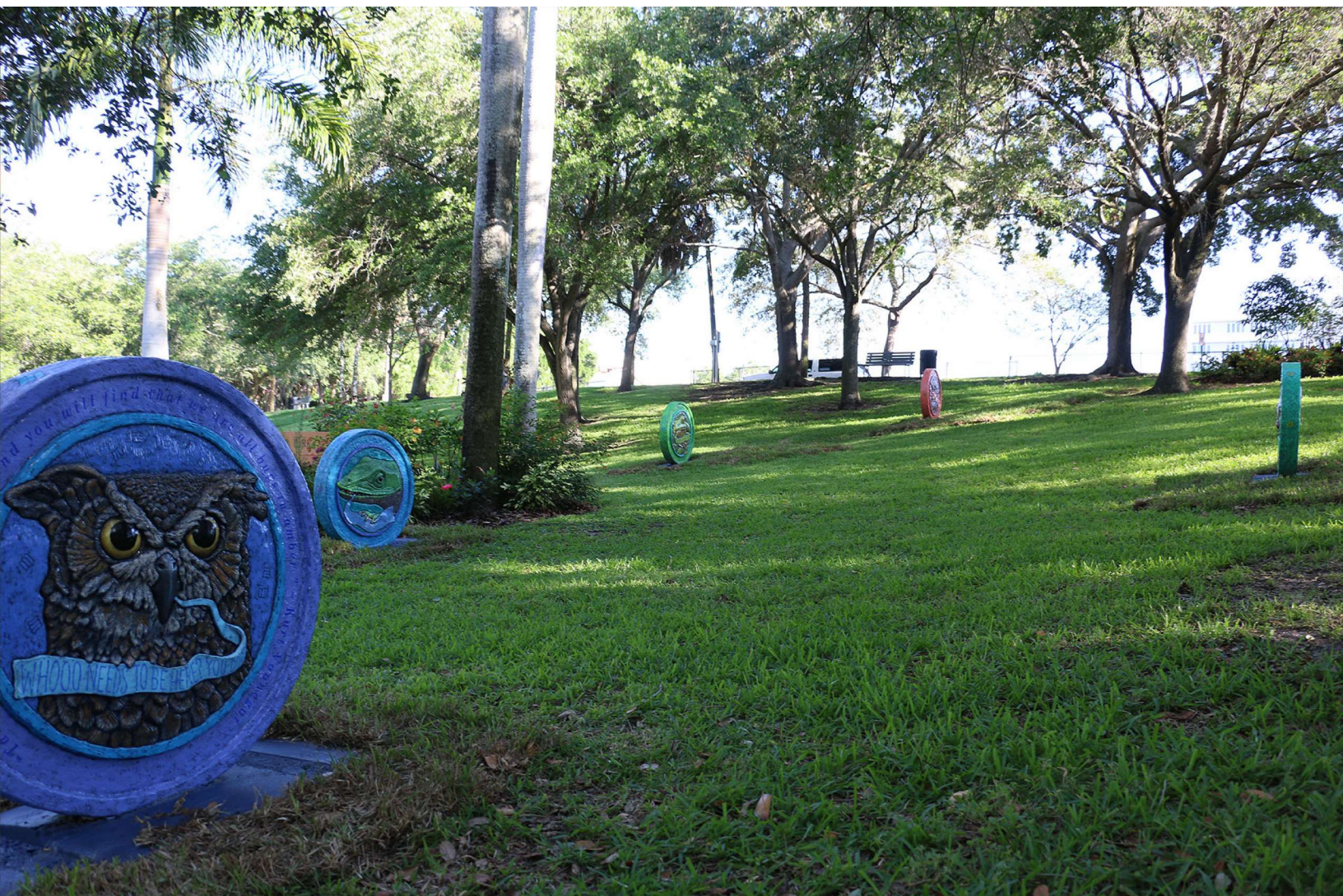
Jeff Whipple, "Relaxation Rollers", hand-built and cast GFRC, concrete stain, gloss clearcoat UV filter protection, 42" diameter x 6" wide, 2021. Commissioned by the City of St. Petersburg, Florida for Roser Park. THEME: Relaxation in a Park. There are quotes about relaxation and bas-relief "talking" animals on both sides.