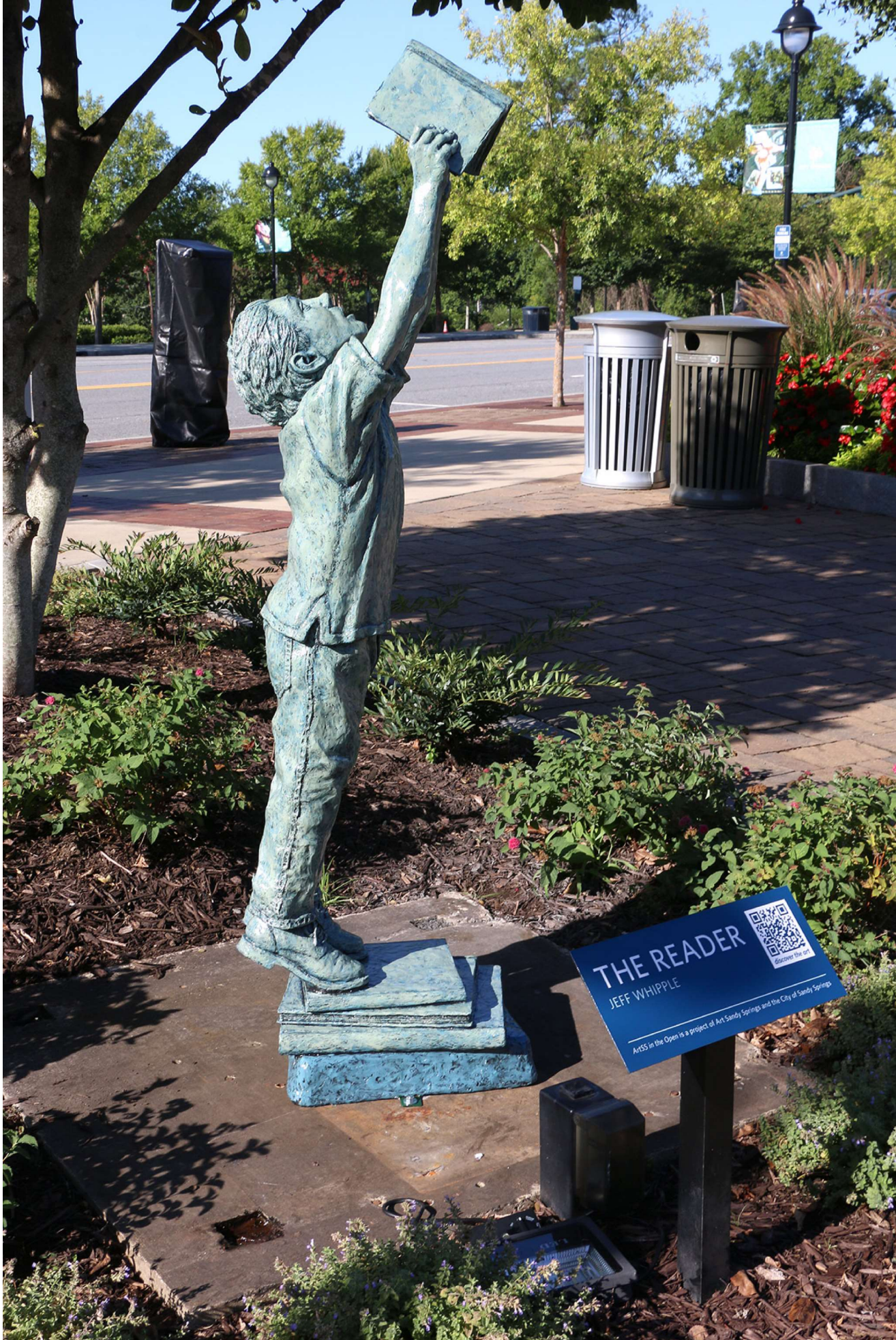
"The Reader" by Jeff Whipple 2023 Concrete and paint with UV protection clearcoat, 68" x 14" x 24" (Life size boy) "ArtSS in the Open", Sandy Springs, Georgia